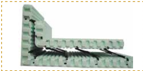
View of folding metal-hinged web and insert web for angled corner (included in order).