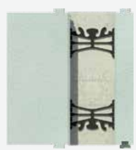
6" (152 mm) R-value - 48